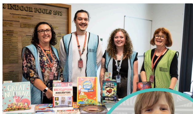
Photos of children collecting their book prizes.