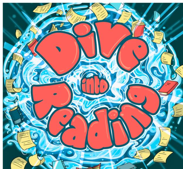
Dive into Reading tree display in the children's area of the library.